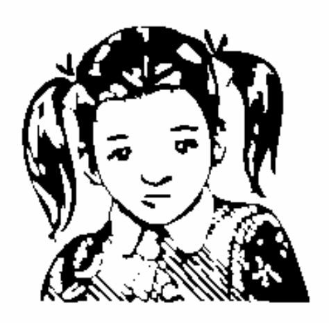
My brother was making fun of someone in school.